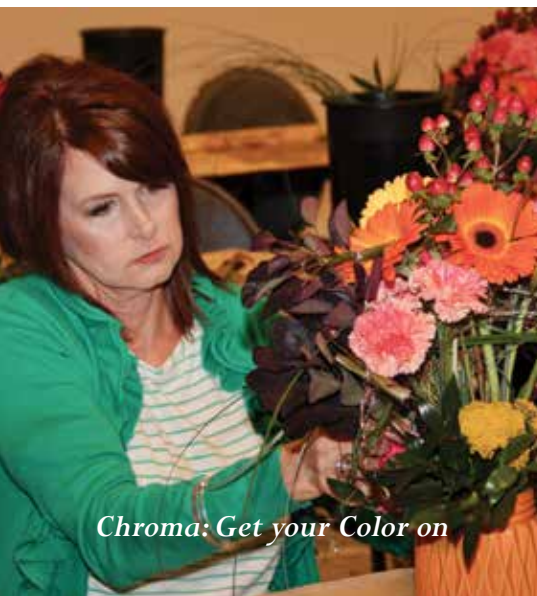
Chroma: Get your Color on