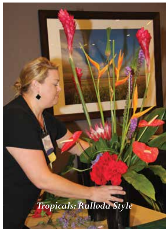
Tropicals: Rulloda Style