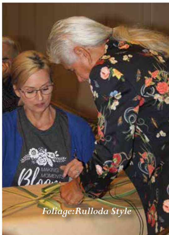
Foliage: Rulloda Style