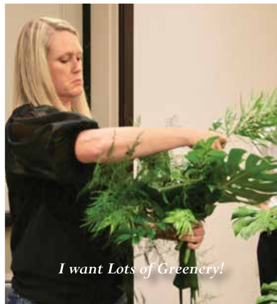
I want Lots of Greenery!