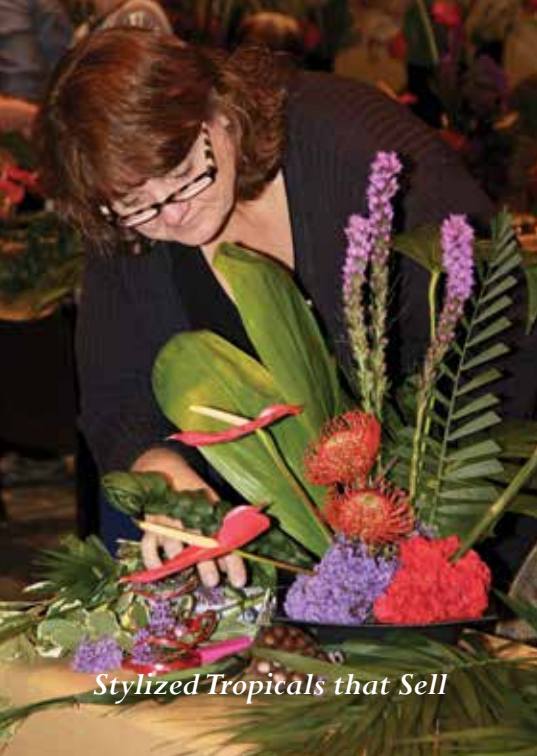
Stylized Tropicals that Sell