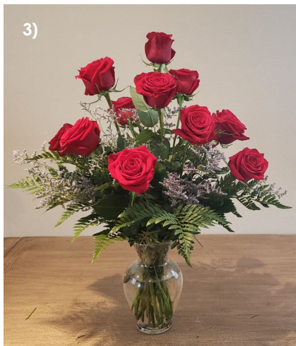
Figure 2.4 Layer 3 – add 3 Roses

Consists of 4 more Roses (there should now be 8 Roses in the vase)