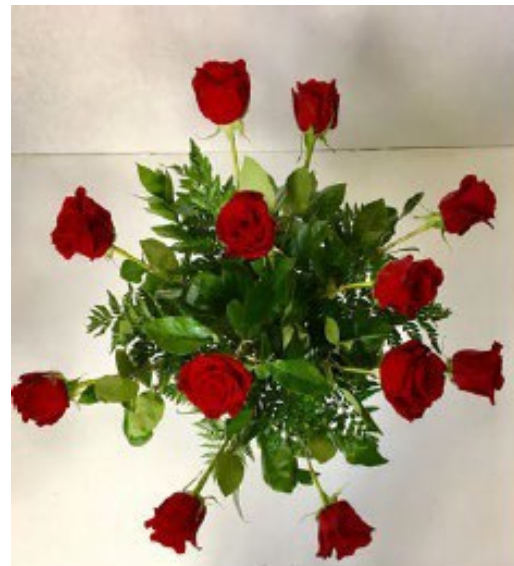
Figure 2.7 TOP VIEW 12 Rose Stems with Leather Leaf