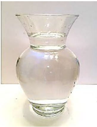
Figure 1.5 8 3/4" Tall Vase