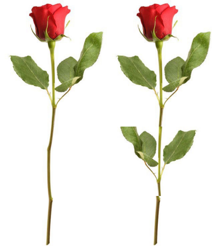
Figure 1.1 Remove any foliage from stem that will be under water