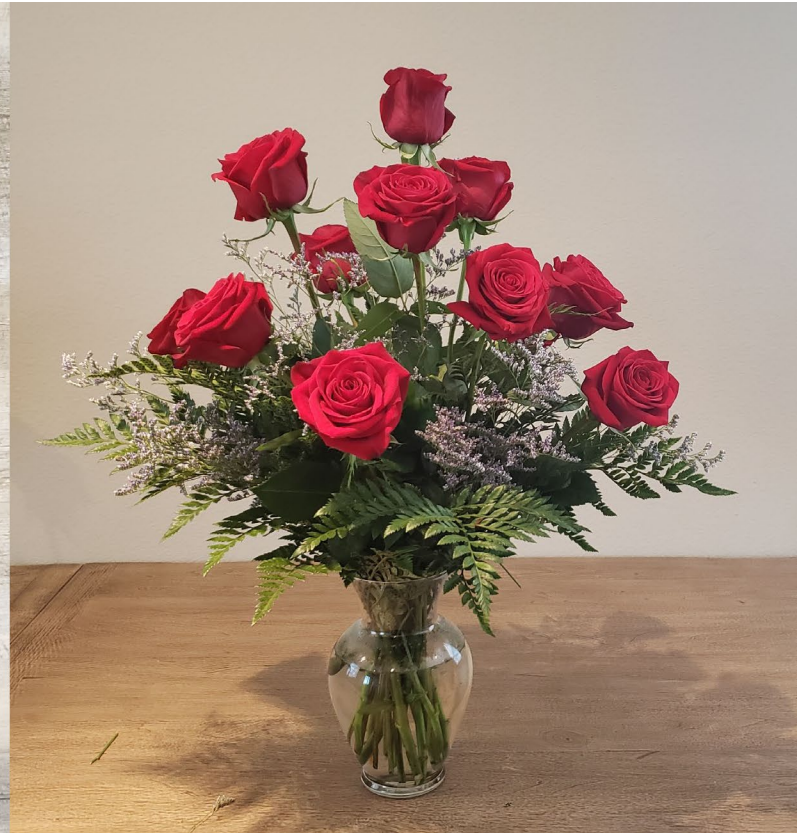
Figure 1.8 Front View of Dozen Roses Vase Arrangement