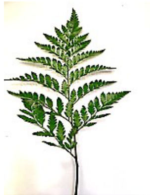
Figure 1.3 Leather Leaf