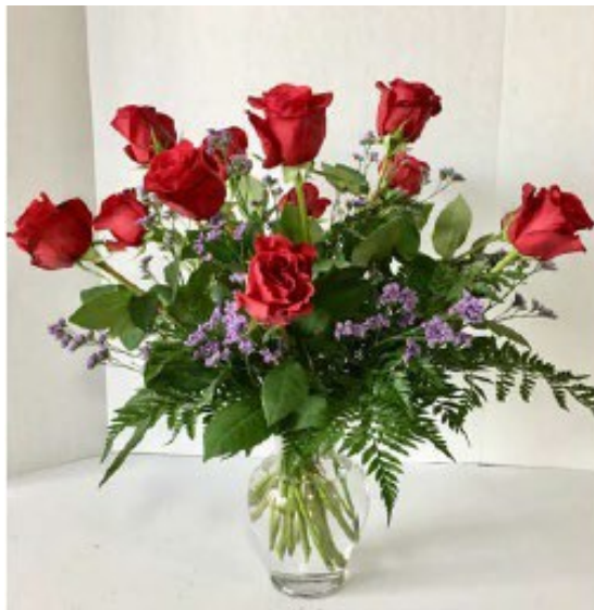
Figure 2.6 SIDE VIEW 12 Rose Stems with Leather Leaf and Purple Limonium

12 Red Roses, 14 Stems of Leather Leaf and 1/3 Bunch of Limonium Filler