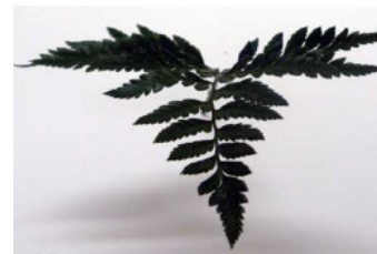
Figure 2.1 Enter from front center toward focal point