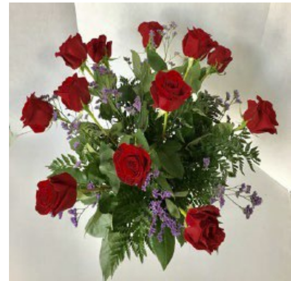
Figure 2.8 TOP VIEW 12 Rose Stems with Leather Leaf and Purple Limonium