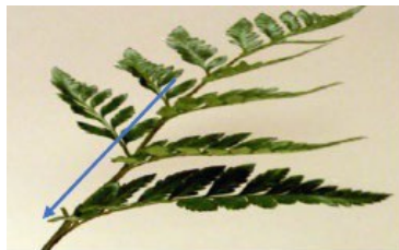
Figure 1.9 Enter from right side toward focal point