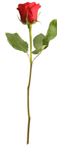
Figure 1.0 Stem should be approximately 22" – 26"