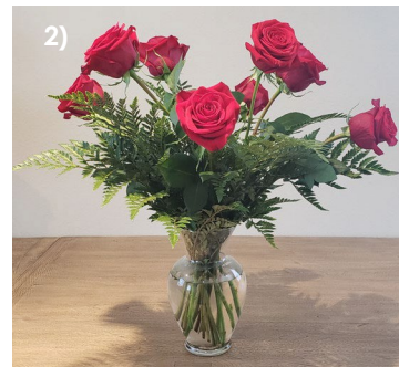
Figure 2.3 Layer 2 – add 4 Roses

Consists of 4 more Roses (there should now be 8 Roses in the vase)