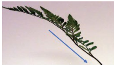
Figure 2.0 Enter from left side toward focal point