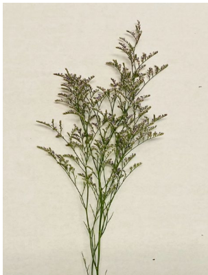
Figure 1.2 Misty, Limonium