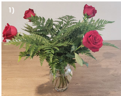
Figure 2.2 Layer 1 – add 4 Roses