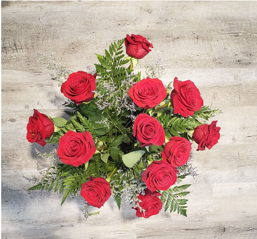
Figure 1.7 Top View of Dozen Roses Vase Arrangement