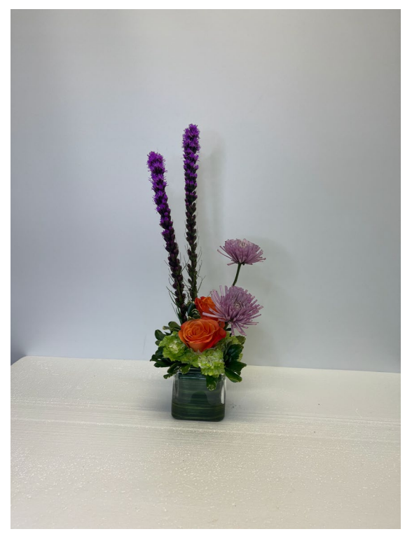
After adding Pittosporum