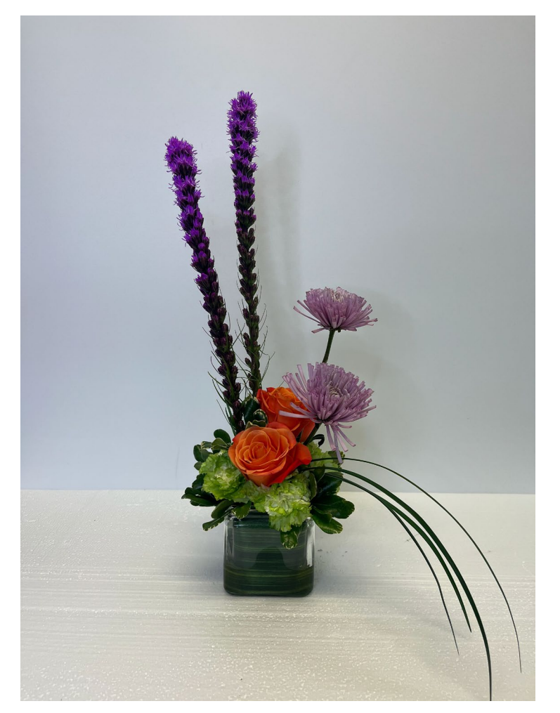
Required Materials and Flowers Needed to Complete Level 2 Asymmetrical Arrangement