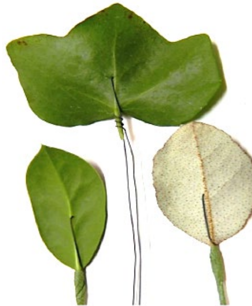
Hairpin Wiring with #28 Wire

Using the stitch method, wire and tape halfway down the wires preparing 5 leaves