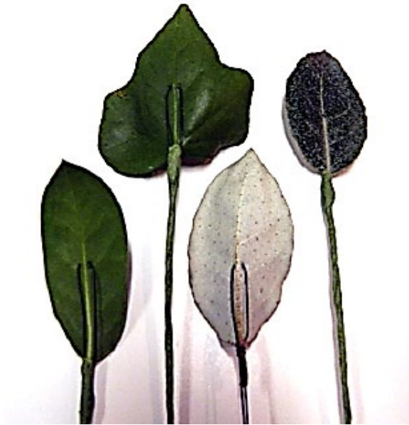
Stitch Wiring with #28 Wire