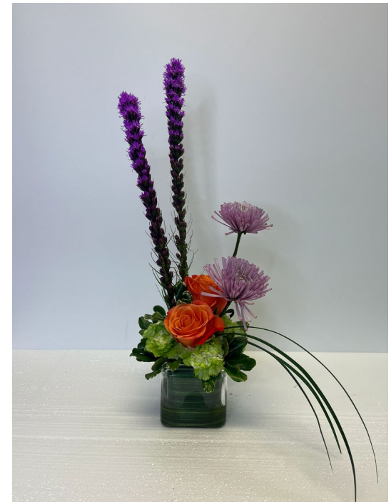
After adding Lily Grass