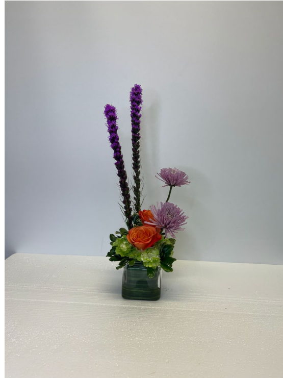
After adding Pittosporum