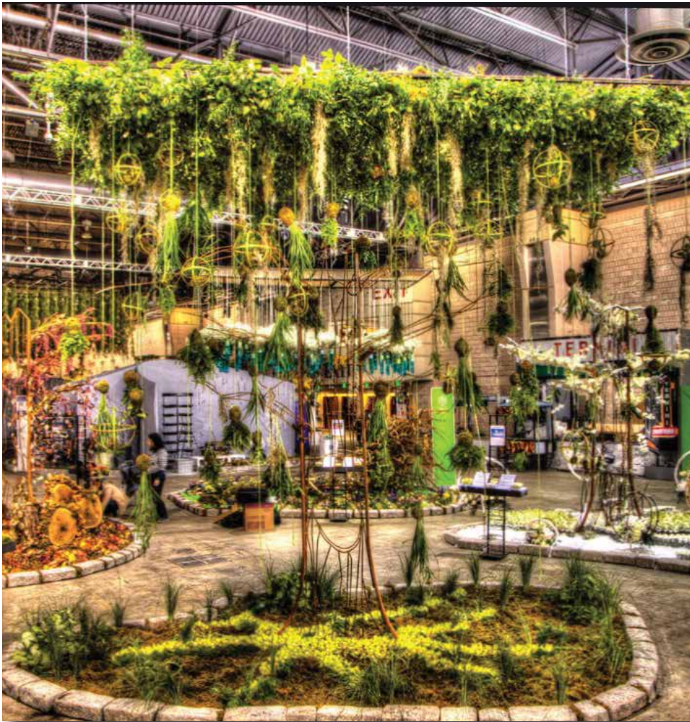
Always helping friends! AIFD North East Regional Exhibit at the Philadelphia Flower Show 2019.