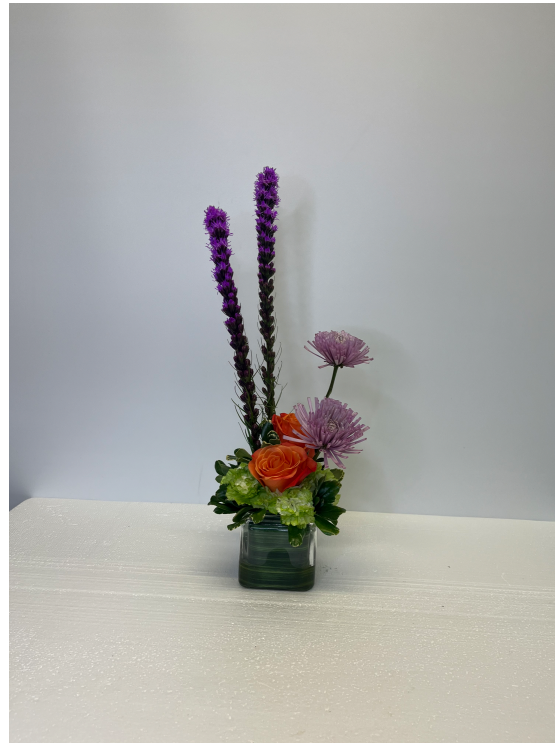
After Adding Pittosporum