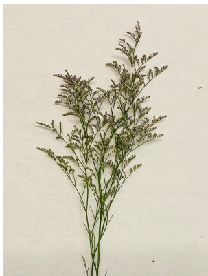
Figure 1.2 Misty, Limonium