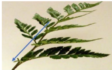
Figure 1.9 Enter from right side toward focal point