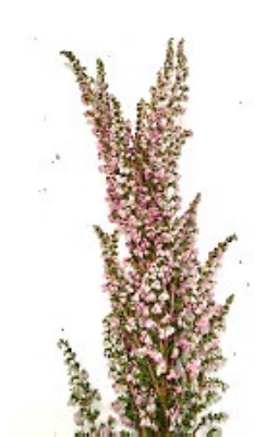
Figure 1.2 Heather