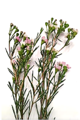
Figure 1.3 Wax Flower