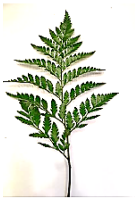
Figure 1.4 Leather Leaf