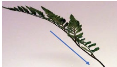
Figure 2.0 Enter from left side toward focal point