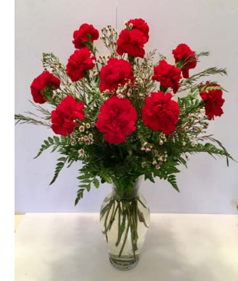
Side View Vase of 12 Carnations, Leather Leaf & Wax Flower 11