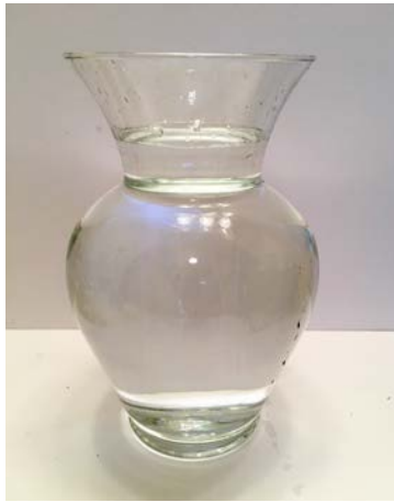
8 ¾" tall vase