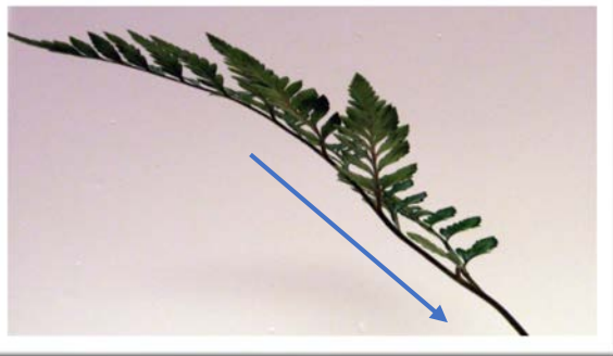
Enter from left side toward focal point