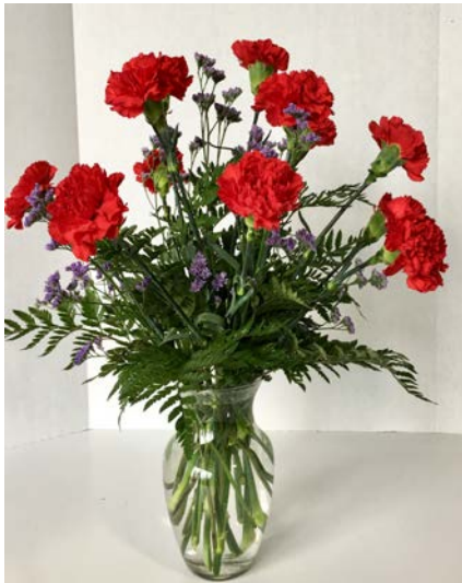
Side View: 10 Carnations with Leather Leaf & Limonium Filler

12 Red Carnations, 10 stems of Leather Leaf and 1/3 bunch of Limonium, Wax Flower or Heather Filler