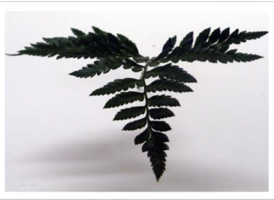
Enter from front center toward focal point