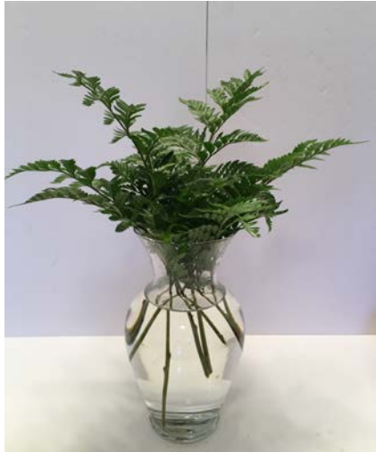
Vase of Leather Leaf