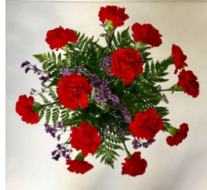
Very Top View: Dz Carnations, Leather Leaf & Limonium