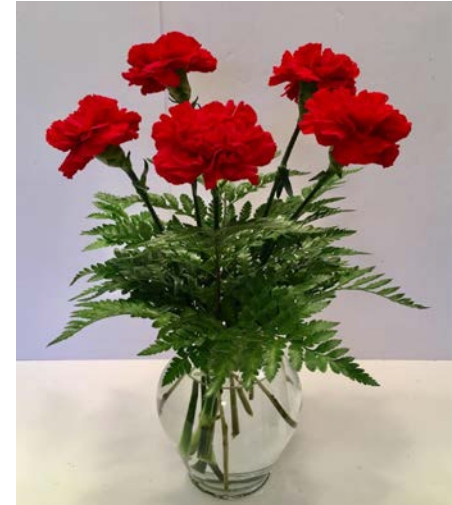
Vase of 5 Carnations & Leather Leaf