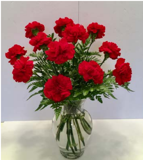
Front View Dz Carnations