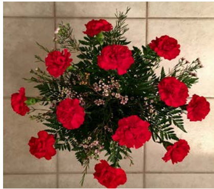
Very Top View: Dz Carnations, Leather Leaf & Wax Flower