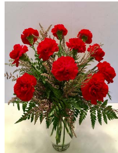
Top View: Dz Carnations with Leather Leaf & Heather Filler