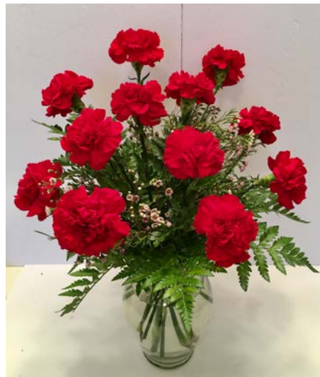
Side View: Dz Carnations with Leather Leaf & Wax Flower Filler