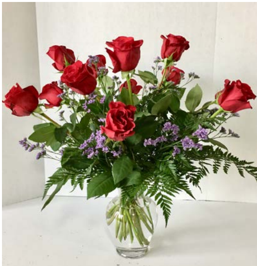
Side View: 12 Rose stems with Leather Leaf & Purple Limonium

12 Red Roses, 10 stems of Leather Leaf and 1/3 bunch of Limonium Filler