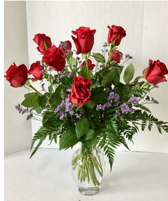
Dz Rose Arrangement