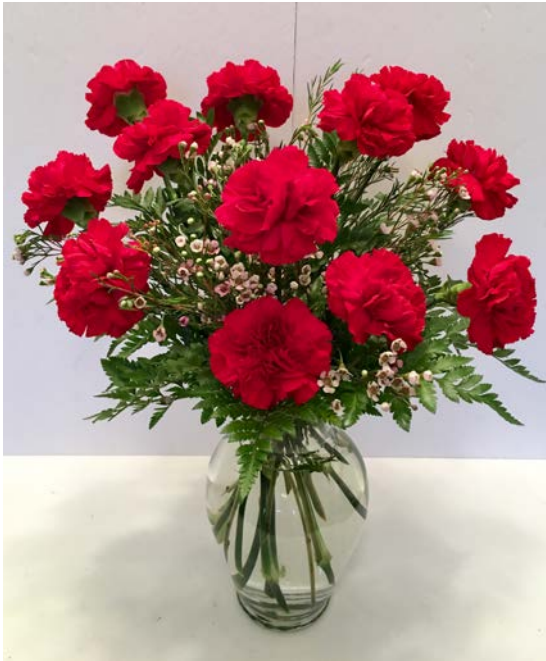
Dz Carnation Arrangement