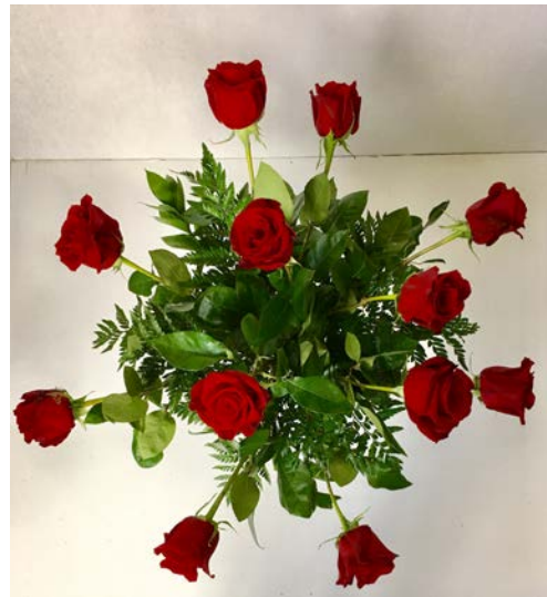
Very Top View: 12 Rose stems with Leather Leaf