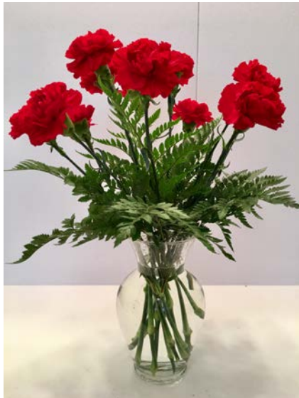
Vase of 8 Carnations & Leather Leaf