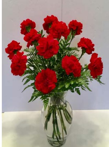
Side View Vase of 12 Carnations & Leather Leaf