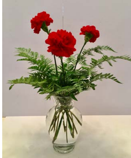
Vase of 3 Carnations & Leather Leaf